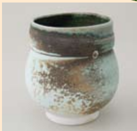
Jack Doherty, 8 August – 27 October