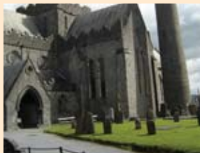
The Mayor's Kilkenny 400 Celebration concert 20 November