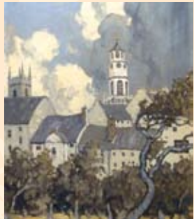
Kilkenny: An Artists' Celebration