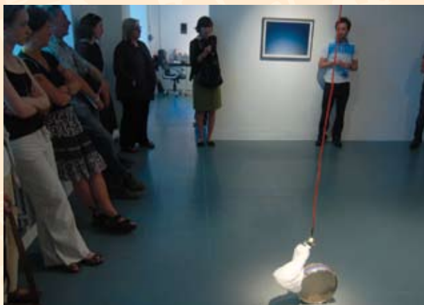
Lunch Time Talks, 14 & 28 October