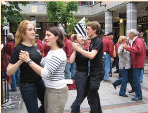
Kilkenny Celtic Festival, 25 September - 4 October