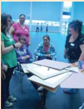
Young People's Workshop, 26 September