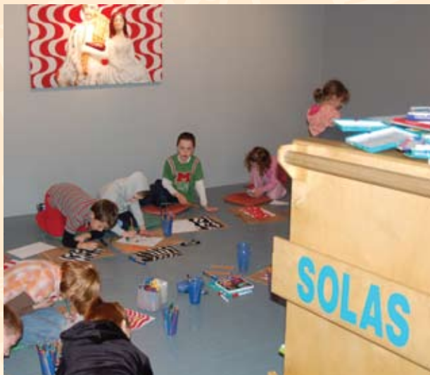
Kilkenny "An Artists' Celebration" 6 and 13 December,